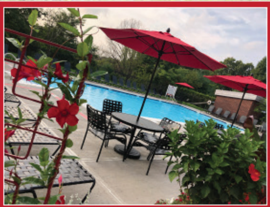
Resort Style Pool and Ambience.