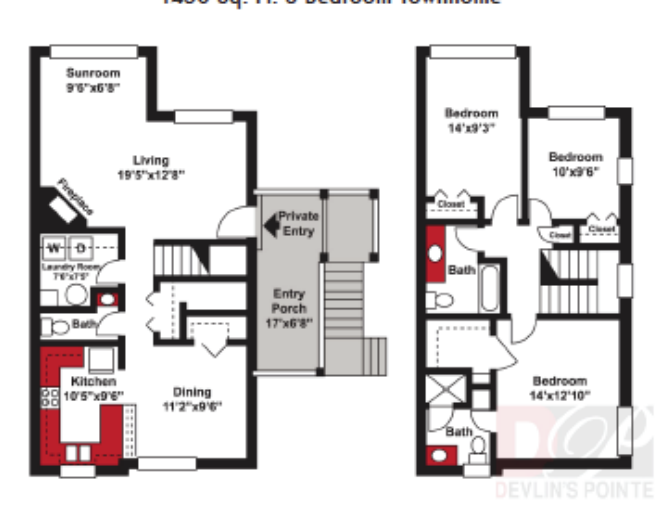
1450 Sq. Ft. 3 Bedroom Townhome