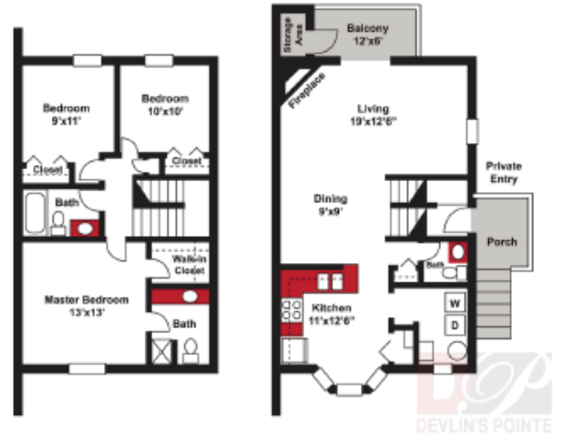
Renderings are subject to errors, omissions or changes and may be withdrawn without notice.