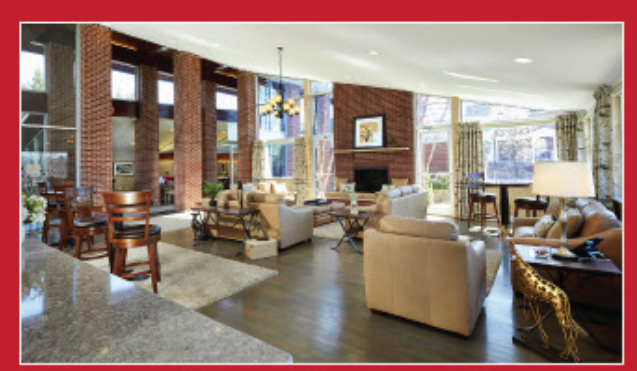
Clubhouse Lounge with Gourmet Kitchen and Internet Café.